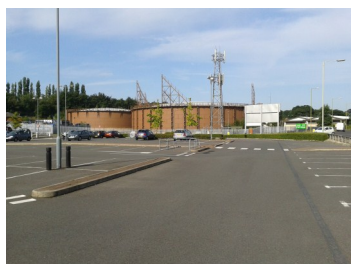
A view of the existing gasometers

The walk will not be too strenuous. It should last about a couple of hours. These walks are always enjoyable. You get exercise as well as learning more about the area. Do come along! Please phone 865061 for any queries.